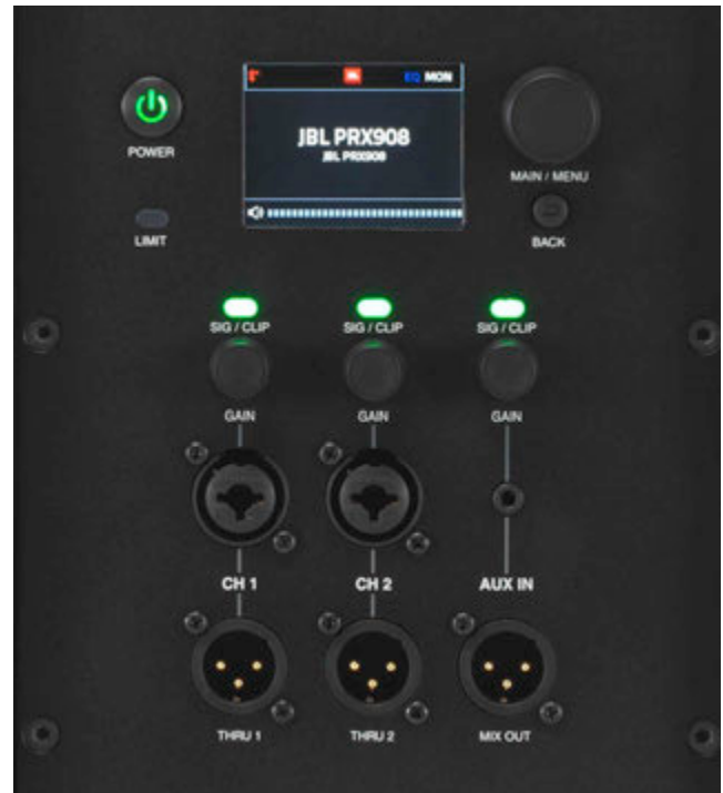
REAR PANEL CONNECTIONS

The JBL PRX908 , part of the PRX900 Series of powered loudspeakers and subwoofers, takes professional portable PA performance to a new level with advanced acoustics, comprehensive DSP, unrivaled power performance and durability, and complete BLE control via the JBL Pro Connect app.