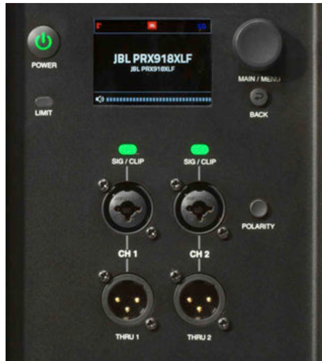
REAR PANEL CONNECTIONS

The JBL PRX918XLF , part of the JBL PRX900 Series powered loudspeakers and subwoofers, takes professional portable PA performance to a new level with advanced acoustics, comprehensive DSP, unrivaled power performance and durability, and complete BLE control via the JBL Pro Connect app.